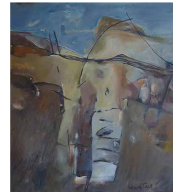
"The best view in town", privately owned for 20 years.